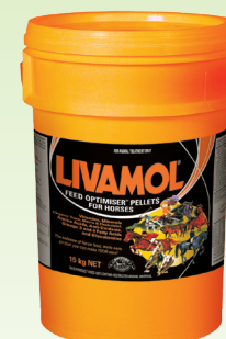
Livamol Feed Optimiser Pellets for Horses*