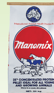
Manomix Pellets for all animals

*See brochure for details or visit our website: www.iahp.com.au