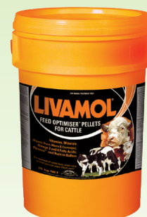
Livamol Feed Optimiser Pellets for Cattle*

As examples we have included ProN8ure - IFS in the following IAH products: